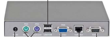
Power DC 6V