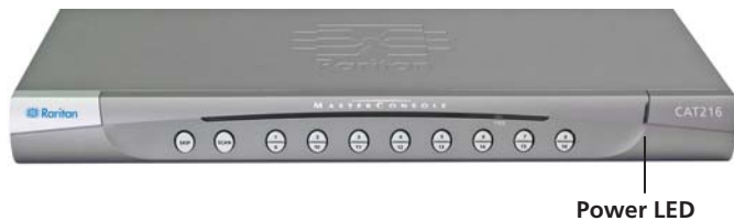
MCCAT216 Front View